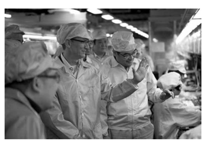
Prophetic voice from China

Some public prophets who have included economic issues in their messages have come as preachers from organised religion. Modern-day prophets have also emerged from among the ranks of investigative journalists, some controversial, reporting to society where they think repentance is needed. Other prophetic voices come from within labour, organising political response to intolerable