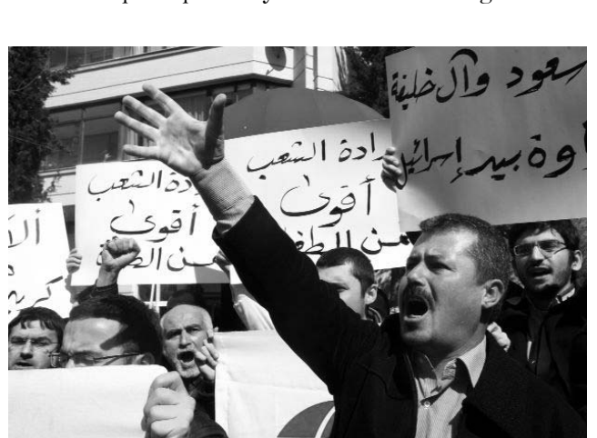
Speaking truth to power Protestors in Egypt in 2012

business. Their words were clear and precise, chosen because of specific abuses of their day. Highly sensitive to the injustices present in society, prophets became public champions of covenant principles telling how to live faithfully. They abhorred the arrogance of greedy leaders. They warned regarding the consequences of being unfaithful to the covenant (Micah 2:12-13; Isaiah 37:21-38; Jeremiah 28:16-17). They courageously spoke of moral imperatives of their day including those relevant to the marketplace. In sum, using the magnifying lens of the covenant principles they focused on revealing the truth