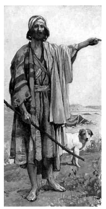
James Tissot, The Prophet Amos c. 1888

the hand that is imposed in reform, the higher the risk that such a hand will be used to manipulate for economic gain. Perhaps many other leaders in commerce are voices for change within their own organisations, voices needed if for no other purpose than to increase efficiency or increase profitability. In addition, there are doubtless others who believe that there are opportunities for moral reform at the level of the industry or economic system, and if given some encouragement, might lift their voices outside their own organisations consideration in society.