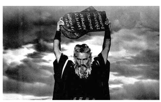
Charlton Heston as Moses in the 1955 film The Ten Commandments

Looking at the stories of prophets (and apostles) contained in Bible narratives we find prophets fulfilling four major functions. First, as mouthpieces for God whose Kingdom is based on truth, the prophets cried aloud and did not spare regarding moral lapses (Isaiah 58:1; Ezekiel 2:3-8). Their message was not merely a general call to improve the ethics of