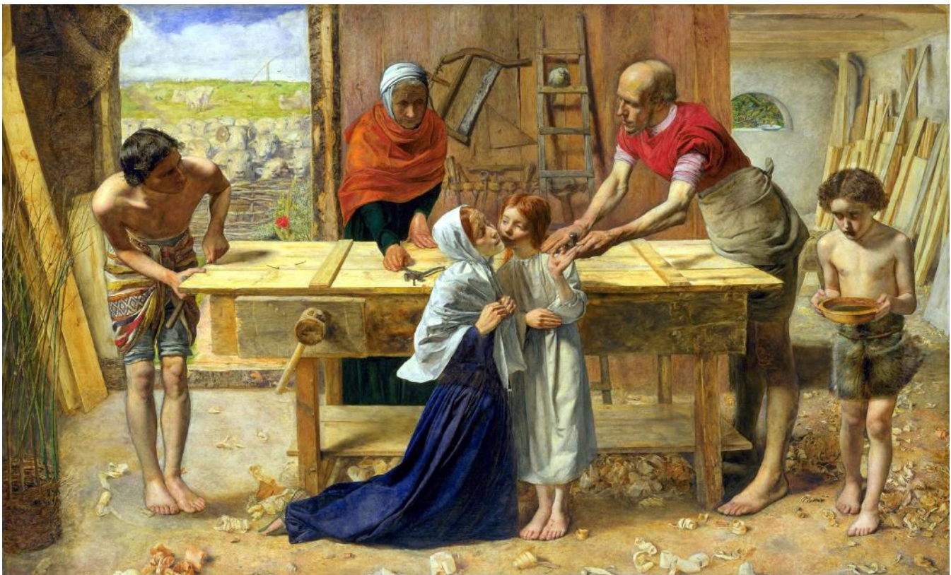
J.E. Millais, Christ in the House of His Parents ('The Carpenter's Shop') (1849–50), Tate Britain

Wood was a scarce commodity in Galilee, and would have been used very