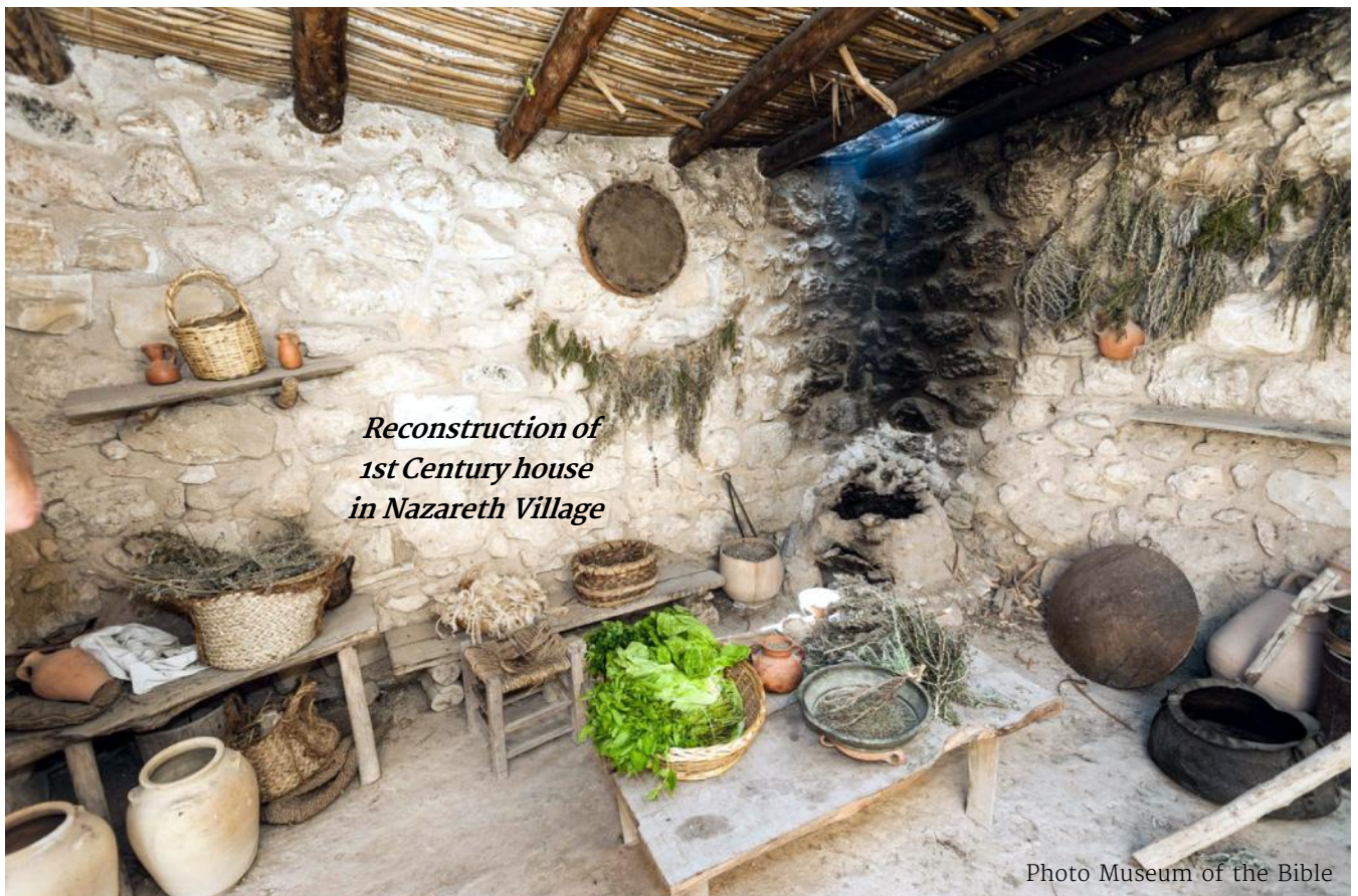
Reconstruction of 1st Century house in Nazareth Village

In contrast to the paucity of references to wood in the Gospels, there are several powerful images relating to building. Jesus likens Peter to the stone (or rock) on which he will build his church (Matt 16:18). He quotes from Psalm 118 about the selection and rejection of stone for building implying this as a metaphor for himself, the rejected stone becoming the cornerstone (Matt 21:42-44). He compares a person who hears and acts on his words as someone who digs deep to build on solid rock; but when someone hears without acting it is like building straight off the soil, with their work being washed away under flood water (Matt 7:24-25). Jesus relates the accidental collapse of a tower at Siloam killing 18 people to make the point that victims of accidents are no more sinners than anyone else (Luke 13:4). He likens the whitewash on the walls of tombs to the hypocrisy of the scribes and Pharisees (Matt 23:27-28). He talks about tearing down barns and building bigger ones (Luke 12:18). When warning about the